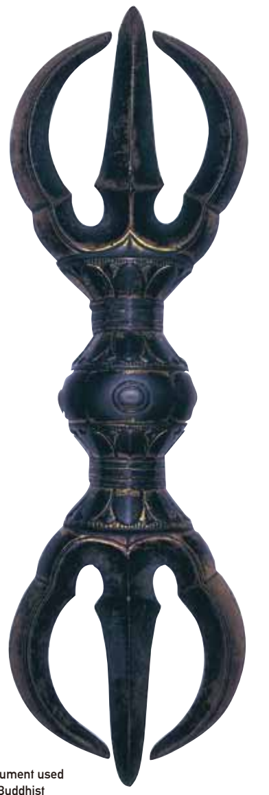
Sankosho Esoteric instrument used by monks in Buddhist ceremonies.